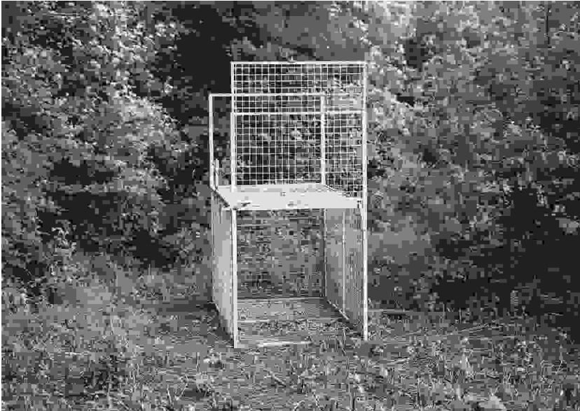
Figure 2. A photograph of a mobile trap used to catch wild boars in our study.

Home range sizes were calculated using the 100% Minimum Convex Polygon (Mohr 1947).